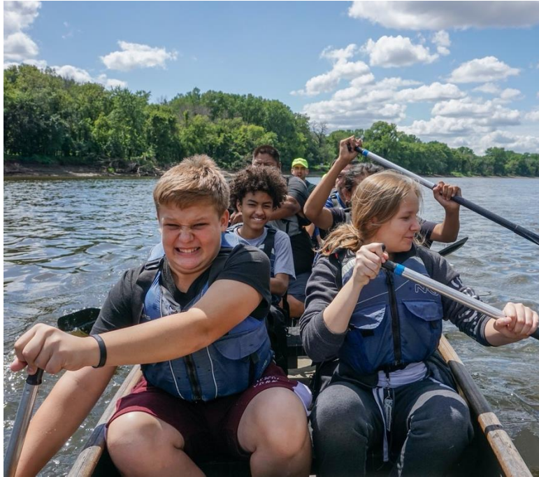
Saint Paul Public Schools American Indian Ed Program Paddles the Mississippi River