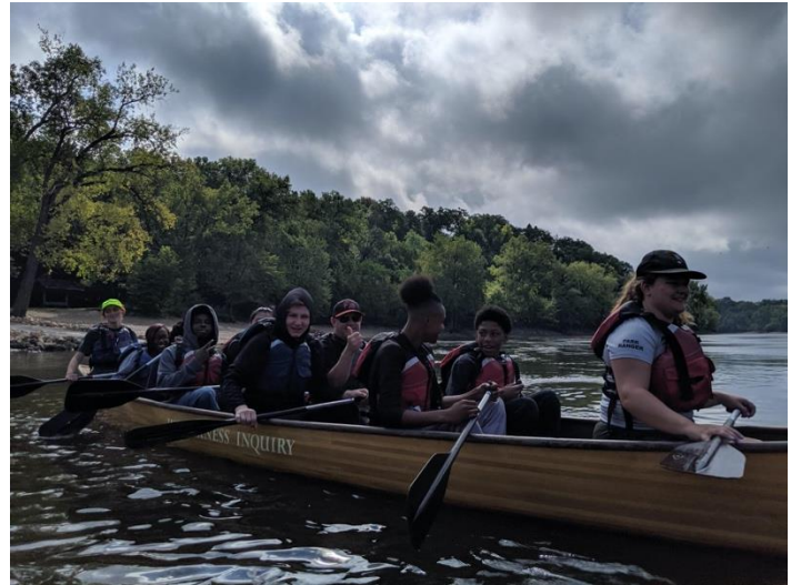
National Park Service rangers join students on the Mississippi River