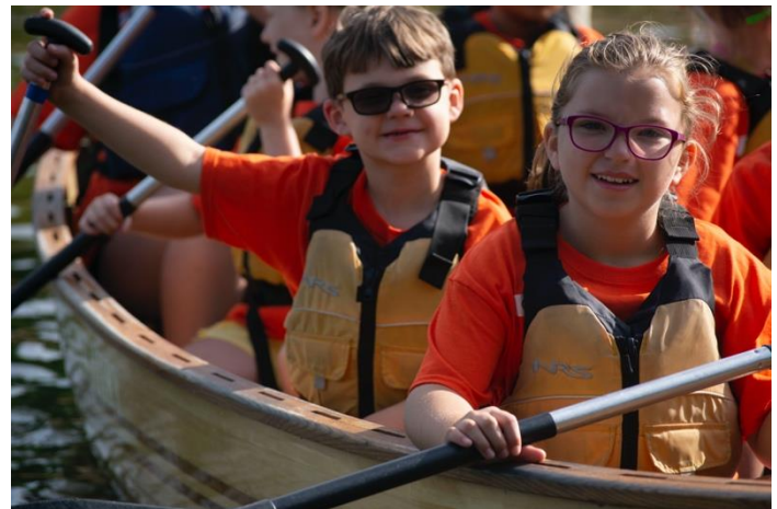
City of Woodbury Parks and Recreation Safety Camp paddles on Carver Lake

Wilderness Inquiry's award winning Canoemobile program brings history and cultural heritage alive for over 8,600 students on their local lands and waterways, fostering a passion for Minnesota's culture and investing in the preservation of our outdoor heritage. Canoemobile features place-based, educational and experiential day trips with land and water activities ranging from local history, water quality science, macroinvertebrate science, fire building, teambuilding, canoeing, and other natural and cultural histories and sciences unique to Minnesota.