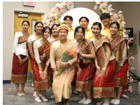
SKLM adults perform during Lao New Year 2024 Brookdale Library, Brooklyn Center

Dancing is not all about being good on the dance floor. It is also about being responsible and hardworking. Skill can always be learned and improved upon. What sets a dancer apart from others is their hard work and dedication to what they do. A responsible dancer knows the importance of arriving on time and doing the proper before beginning class or rehearsal. They must know how to listen to their instructor and adjust as needed.