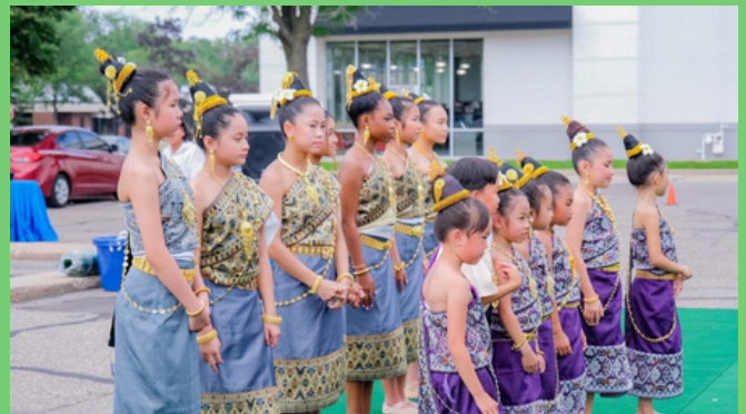
Sanghadana Offering Ceremony, Sawatdee Restaurant, Bloomington