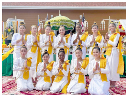
Naga Head Casting Ceremony Temple in St. Paul

Every student dancer grows not just as a skilled dancer but as a disciplined, responsible, and creative individual in this world. We bring out the best in students by bringing out the dancer inside.