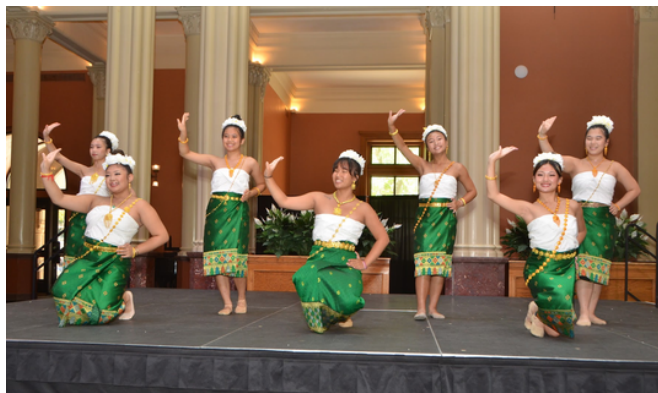
Lao cultural performance by SKLM Teen and Kids groups during the Mid-Autumn Festival, Landmark Center, St Paul, MN.