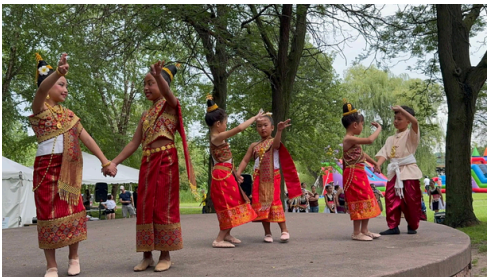
SKLM groups perform at the MN Dragon Boat Festival Phalen Lake, St. Paul