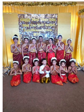
SKLM kids perform during Lao New Year 2024 Buasavanh Hall, Brooklyn Park

The next phase of the Siengkane Lao MN will be completed with a Fiscal Year 2025 Arts and Cultural Heritage Fund grant. No subgrants will be solicited or awarded from this grant.