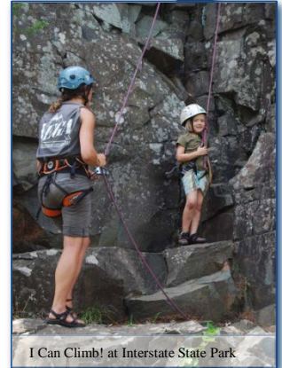
I Can Climb! at Interstate State Park

FY11 Funds Expended/Encumbered as of 12/31/2011: $3,203,616