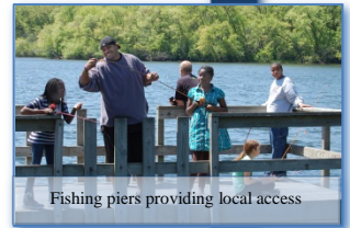
Fishing piers providing local access