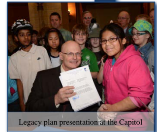
Legacy plan presentation at the Capitol