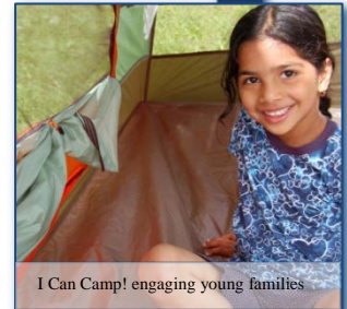
I Can Camp! engaging young families