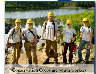
Conservation Corps are youth workers