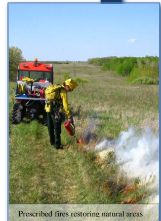
Prescribed fires restoring natural areas