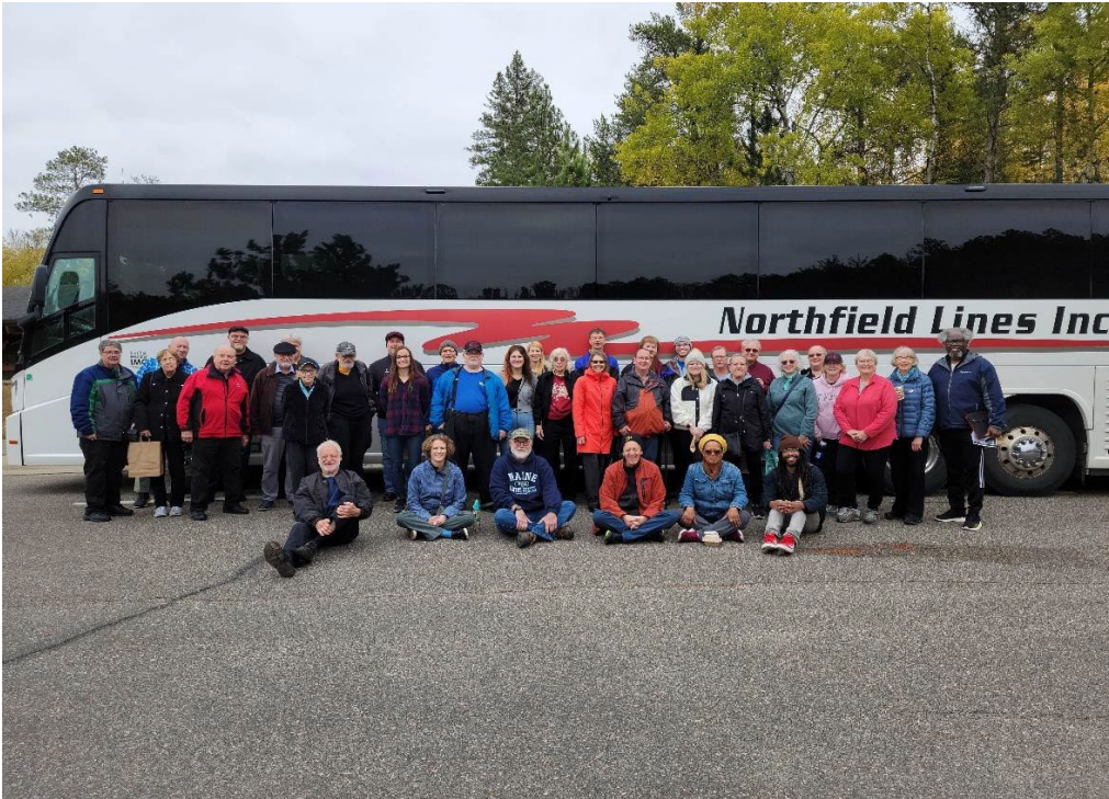
MSB on the way to the concert at the Red Lake Nation in Redby MN.