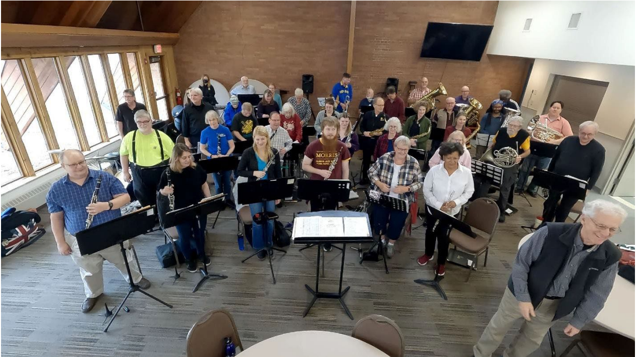
MSB at Calvary Lutheran Church performing an afternoon concert for Park Rapids area senior citizens