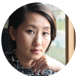
Kao Kalia Yang Author