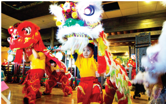
Children perform a traditional dragon dance during the Taste of Little Mekong in Saint Paul