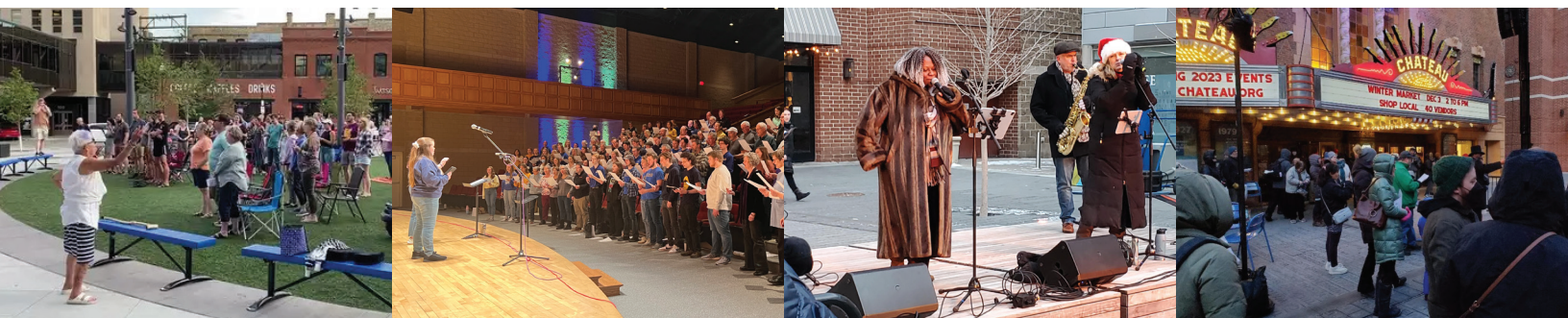
FIRST: Bring the Sing Fargo-Moorhead SECOND: Bring the Sing Duluth at the Mitchell Auditorium on the College of St. Scholastica THIRD: Bring the Sing Rochester FOURTH: Bring the Sing Rochester