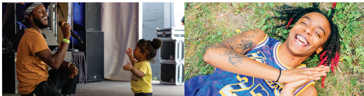
Crowd gathered at and around The Hook and Ladder in Minneapolis for the South of the Southside Festival on Juneteenth