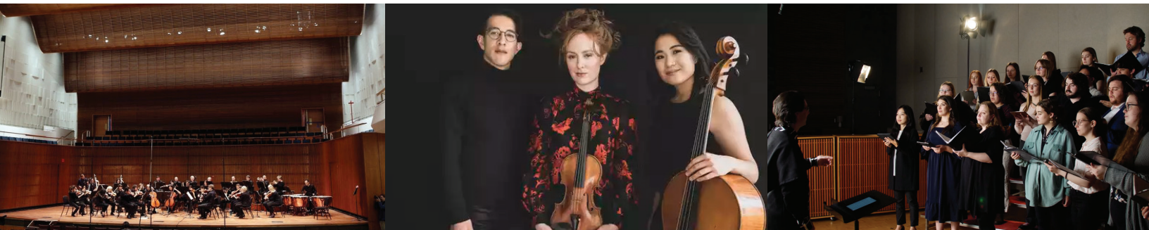
LEFT: St. Paul Chamber Orchestra MIDDLE: The Merz Trio performed at the Minnesota Beethoven Festival in Winona RIGHT: Voces8 Scholars and Augsburg University Choir perform Nunc Dimittis