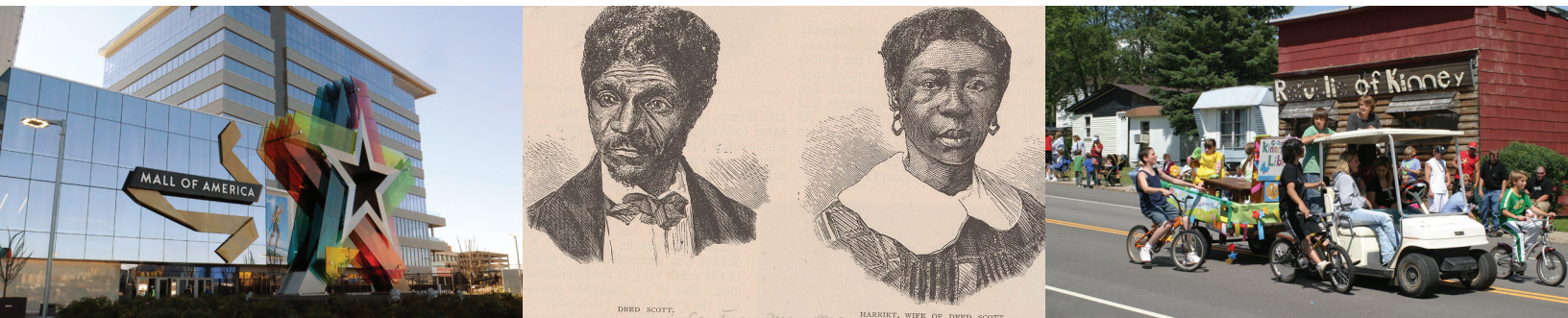
LEFT: The new main entrance of the Mall of America in 2015, flanked by the JW Marriot hotel and an office building MIDDLE: Dred Scott and Harriet Robinson Scott in an illustration from the Library of Congress RIGHT: A parade entry passes a building with a "Republic of Kinney" sign during a Republic of Kinney 30th anniversary parade in 2007

Dred Scott, a black man enslaved to an army officer in the 1800s lived for a time at Fort Snelling. When he later sued his owners to gain his freedom, he used the argument that he had lived in Minnesota, which was considered free soil: Dred Scott's fight for freedom is a Minnesota story