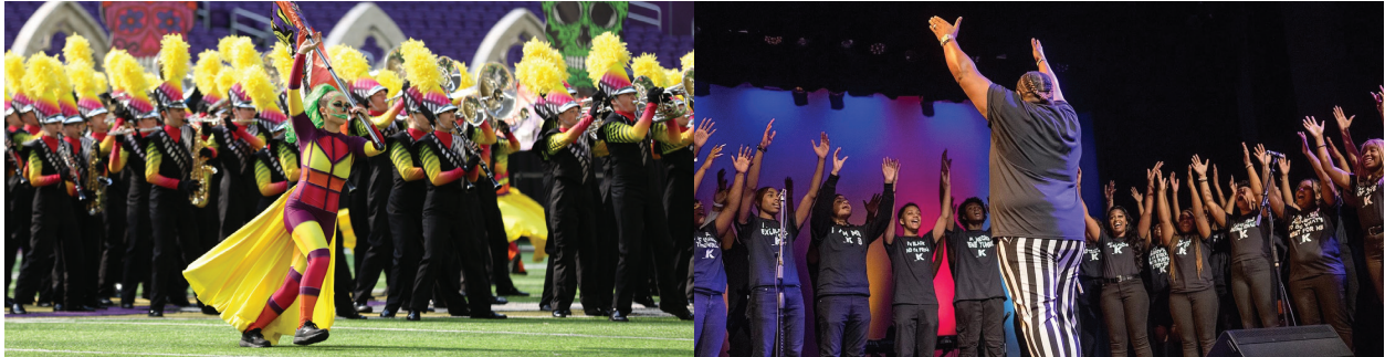
Grand Rapids High School marching band performs at the Youth in Music Championships

Annual high-school marching band championship at U.S. Bank Stadium , featured 21 Minnesota bands nearly half of which were from Greater Minnesota: Relive 34 top marching bands' shows at 2022 Youth in Music Championships this story included an online gallery with more than 100 photos, including of every band.