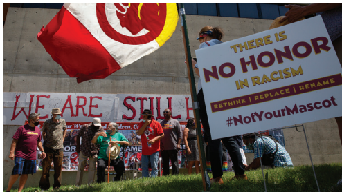
A group stands outside the American Indian Center in 2020 before a press conference on the Washington NFL team's decision to change its team name and logo

Of note this year was the digitization and processing of the American Indian Movement analog tape recordings (collection spans 1972 - 2023). This work included not only hours spent digitizing the analog tape reels, but also time spent listening deeply to the recordings and editing record metadata to ensure that information about the audio is correct and accurate so that it can be made accessible to our MPR brand partners and the public. Of particular interest is an August 28, 1974 interview with Harry Belafonte outside of the Saint Paul courthouse where the trial of Dennis Banks and Russell Means was being held.