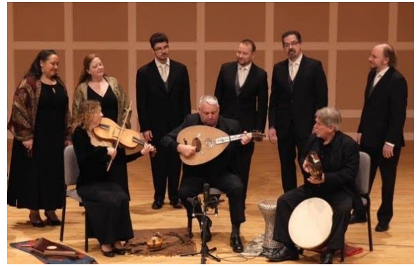
The Rose Ensemble presented songs from their The Three Faiths program, featuring medieval and renaissance music from the Middle East, North Africa, and Spain with traditional instruments.

Class Notes Artists often functions at capacity based on high demand, ensemble availability and cost to employ, and time devoted to program management. Recently the program has been described more widely to major individual donors, more support has been provided. As a result, Classical MPR has been able to leverage Legacy funds to secure private donations to pilot potential program expansion.