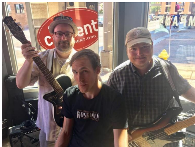
Duluth band Glitteratti