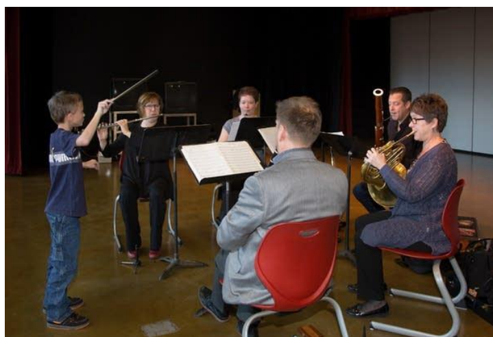
Class Notes Artists ensemble Concordia Wind Quintet invites a Woodland Elementary (Alexandria) student to conduct them