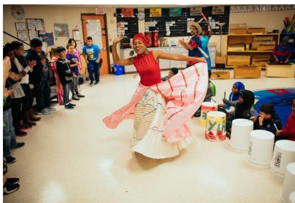
Afoutayi , a Haitian dance, music, and arts company, brought their energetic, colorful, and joyful performances to schools in the Twin Cities.

Class Notes Artists also provides employment for professional artists. During the 2017-2018 school year, eleven Minnesota ensembles provided programming across the state. (NOTE: All photos in this section by MPR or courtesy of the artists.)