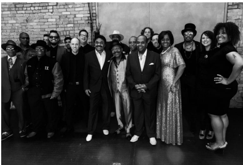
Got to be Something Here book release event at The Fitz featuring Minnesota musicians who have contributed and currently contribute to the "Minneapolis Sound"