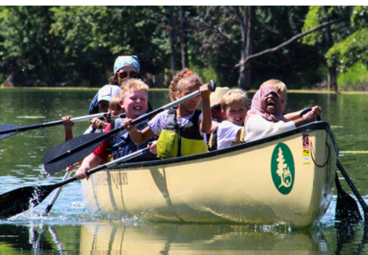
Students paddle on Chester Lake in Rochester.