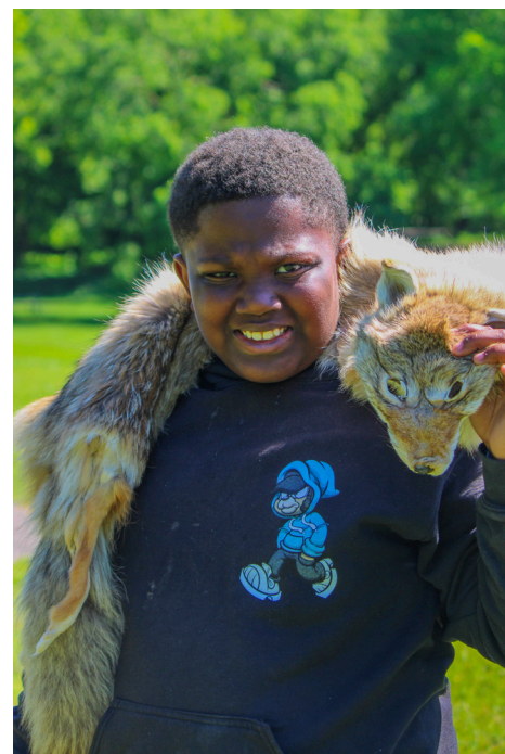
Student learns about local wildlife at Fort Snelling State Park.