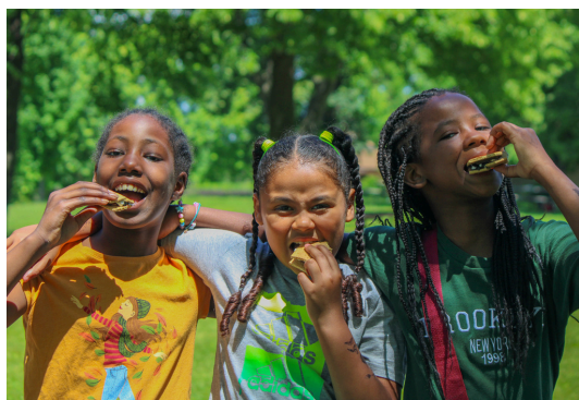
Students enjoy s'mores after learning fire-building skills.