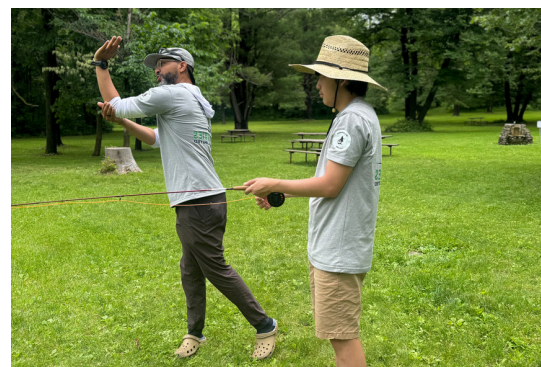
Harding Earth Club students learn how to fly fish in Whitewater State Park.