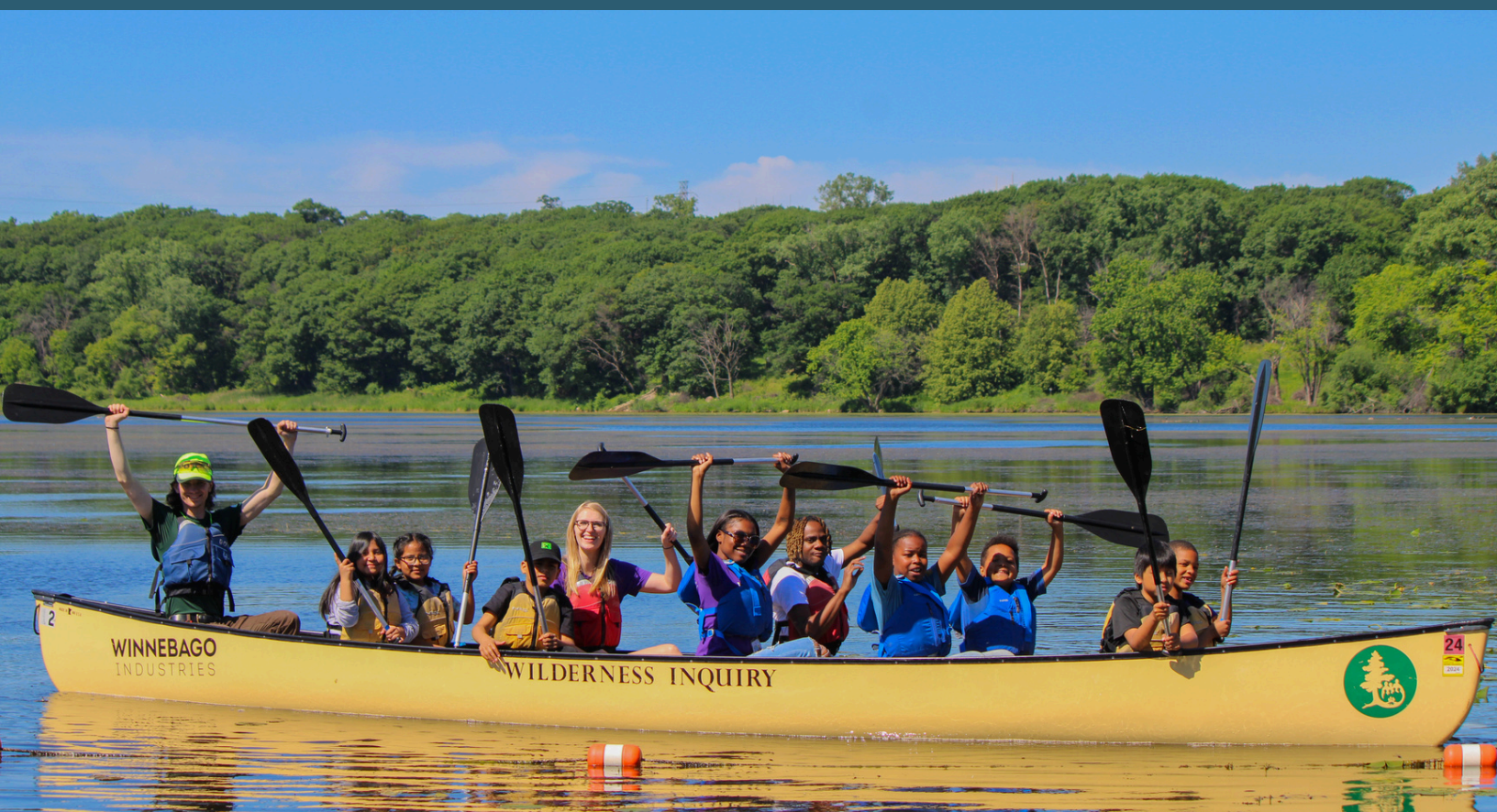
Youth participants paddle and explore on Lake Snelling.